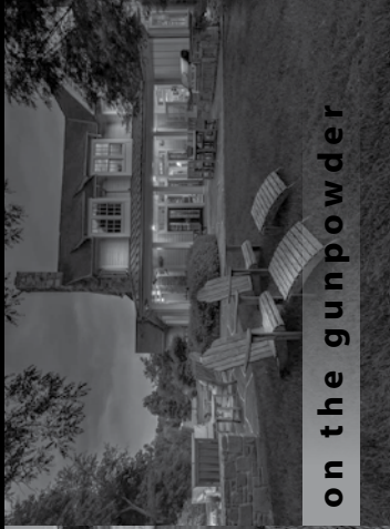
on the gunpowder